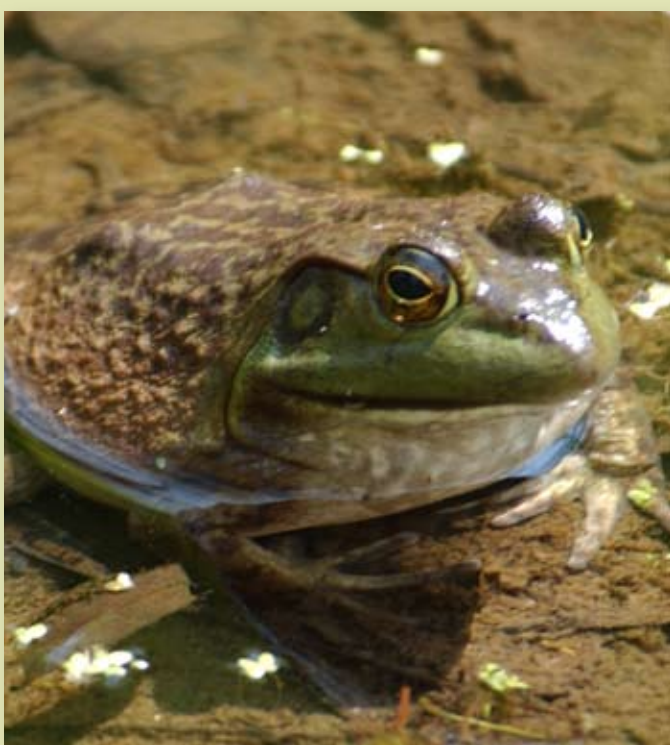
Bullfrog ( Rana catesbeiana )

During colonial times, the Pennypack valley's proximity to one of America's earliest and largest settlements coupled with its abundant water power resources guaranteed its rapid conversion from forest to an agricultural and industrial landscape featuring 30 mills and dozens of bustling villages. The advent of the railroads in the mid 19th century connected the Greenway's villages to Philadelphia and further transformed the valley. Now largely urban and suburban with over 250,000 residents, the valley nevertheless retains pieces of its colonial history. For example, the Greenway contains 43 sites either already listed or determined to be eligible for listing on the National Register of Historic Places. From the nation's oldest stone arch bridge (1697) that crosses the Pennypack where Native Americans had forded the creek to distinctive religious institutions and museums perched on the valley's rim, the Pennypack Greenway offers a cultural panorama that spans our nation's heritage.