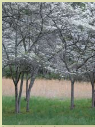
Flowering dogwoods ( Cornus florida )

Some of the busiest, most congested and stress-inducing traffic is found on roads crossing southeastern Pennsylvania—the Pennsylvania Turnpike, U.S. 1, and Interstate 95. Unbeknownst to the vast majority of the drivers barreling down these highways, they are crossing some of the quietest, greenest, and most restful landscapes in the urbanized East—the Pennypack Greenway.