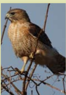
Red-shouldered Hawk ( Buteo lineatus )

The mixed oak woodlands that give character to the Pennypack Greenway provide habitat for a rich diversity of species—some rare and endangered. In the skies overhead, the Pennypack Greenway is an important component of the Atlantic Flyway along which birds migrate with the seasons. Many thousands of birds use the Greenway to rest and refuel during their migrations,