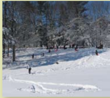
Skidders in Lorimer Park

One day, a trail may stitch together many of the natural areas along the creek. But it is not necessary to wait for a completed trail to enjoy the Greenway. Pennypack Park provides dozens of miles of hiking and equestrian trails and features a popular 9-mile paved all-purpose trail from Pennypack on the Delaware north to Pine Road. Pennypack Park's trail system links directly to six miles of trails in Lorimer Park, and the Pennypack Preserve offers hikers, bikers, and nature lovers 10 more miles of trail