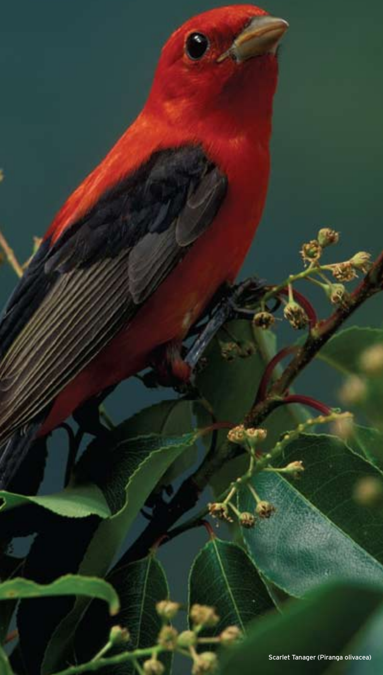
Scarlet Tanager ( Piranga olivacea )