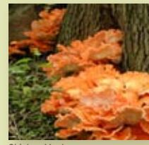
Chicken Mushroom ( Polyporus sulphureus )

and some stay to nest. Dozens of species are year-round residents. More than 200 species of birds have been recorded in the Greenway - half of all bird species recorded in Pennsylvania. In the creek itself, hickory