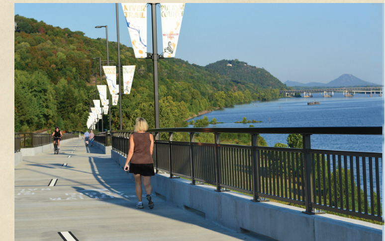
Pinnacle Mountain can be seen in the distance from the Big Dam Bridge.

Spanning 4,226 feet over the Murray Lock and Dam, the Big Dam Bridge is the longest bridge in the country built specifically for walkers and cyclists. The $12.5 million project took eight years to complete and required cooperation from federal, state and local agencies to produce one of the state's finest attractions. The Big Dam Bridge unites the cities of Little Rock and North Little Rock, while improving the health and fitness of residents and guests. The Big Dam Bridge can be accessed from Murray Lock and Dam in Little Rock or Cooks Landing in North Little Rock.