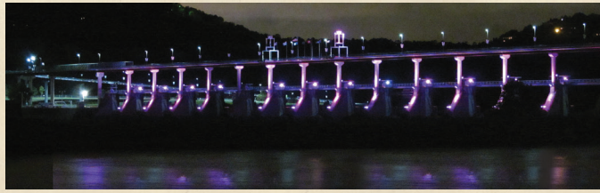
The Big Dam Bridge and Two Rivers Park Bridge are great places for visitors to view the night sky.