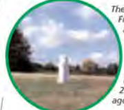
The Stone of Free Speech acted as a focus for political and religious meetings 200 years ago.

Get off the beaten track... use the map to explore your own trails!