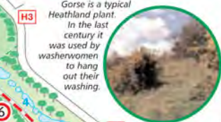
Gorse is a typical Heathland plant. In the last century it was used by washewomen to hang out their washing.

"What is the Bay of Naples, with its bitter, relentless gentian blue overhead, and its sun-scorched, dusty and grassless ground beneath, compared to this view from Hampstead Heath? Where else can you find such satisfying beauty?" The Contemporary Review, July 1894