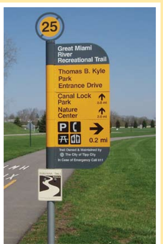
Look for these signs all along the Miami Valley Bikeways.