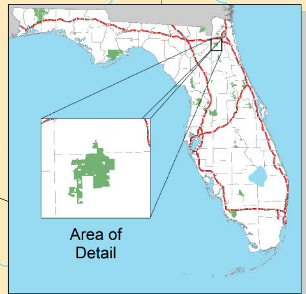
Area of Detail

DISCLAIMER This map is the product of the Florida Forest Service. No warranties are provided for data therein, its use, or its interpretation.